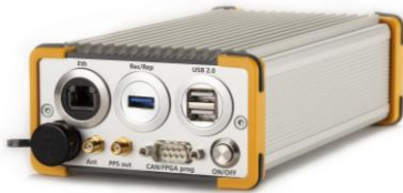
GOOSE receiver platform

The GOOSE platform is an FPGA based GNSS receiver. It is therefore flexible in processing new or proprietary signals. It comprises 60 hardware channels in real time and provides an open software interface for customer applications. It grants deep access to the hardware interface, down to e.g. integrate and dump value levels. Additionally, the intermediate frequency signals can be recorded, processed and replayed with the platform. GOOSE is meant as a rapid prototyping solution for the development of state of the art GNSS receivers. The platform is dedicated to software developers and mobile communication operators. It is also characterized by four separate components: a multi-frequency GNSS antenna, an analog-frontend board, a baseband board, and the processor system.