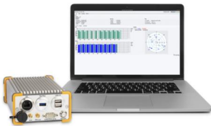
GOOSE User Interface

The GOOSE platform is an FPGA based GNSS receiver. It is therefore flexible in processing new or proprietary signals. It comprises 60 hardware channels in real time and provides an open software interface for customer applications. It grants deep access to the hardware interface, down to e.g. integrate and dump value levels. Additionally, the intermediate frequency signals can be recorded, processed and replayed with the platform. GOOSE is meant as a rapid prototyping solution for the development of state of the art GNSS receivers. The platform is dedicated to software developers and mobile communication operators. It is also characterized by four separate components: a multi-frequency GNSS antenna, an analog-frontend board, a baseband board, and the processor system.