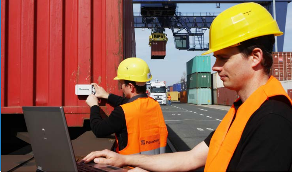
Figure 1: Installation of tracking modules with energy harvesting power supply on railway containers