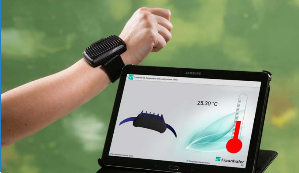
Figure 3: Wristband with Bluetooth module and thermo-electric power supply

Special care must be taken in matching the internal resistance of the transducer and the power management or the load to maximize the harvested electrical energy. Besides passive matching, active techniques like maximum power point tracking (MPPT) and non-linear circuits can be used to achieve this goal with maximum efficiency. A major obstacle is the power consumption and start-up of the power management unit itself. It must not consume a significant part of the overall power consumption and save enough for the main application of the self-powered system. With maximum efficiency of the power management unit, the energy transducer can be minimized allowing an optimized design in terms of volume and cost.