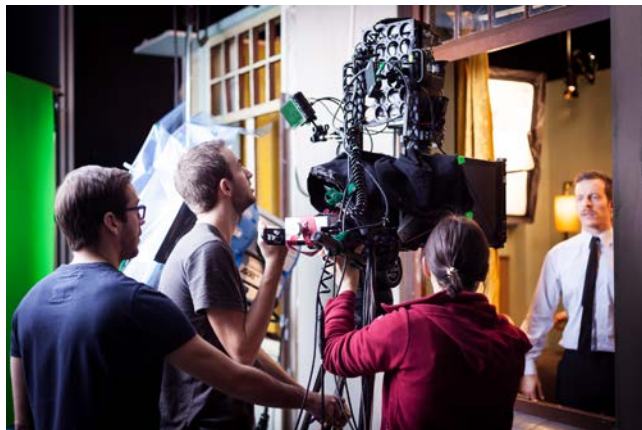
Production set for live-action pilot clip "Coming Home" © Fraunhofer IIS/HDM Stuttgart | Picture in color and print quality: www.iis.fraunhofer.de/en/pr

The Fraunhofer-Gesellschaft is the leading organization for applied research in Europe. Its research activities are conducted by 66 institutes and research units at locations throughout Germany. The Fraunhofer-Gesellschaft employs a staff of nearly 24,000, who work with an annual research budget totaling more than 2 billion euros.